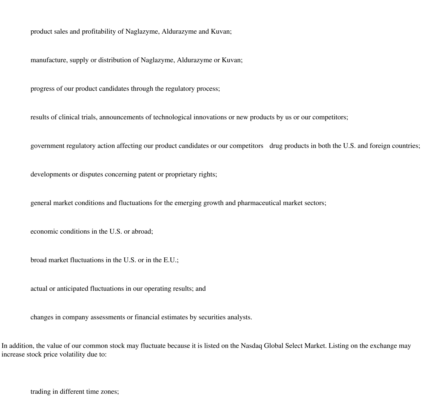
Table of Contents 63

Our valuation and stock price since the beginning of trading after our initial public offering have had no meaningful relationship to current or historical earnings, asset values, book value or many other criteria based on conventional measures of stock value. The market price of our common stock will fluctuate due to factors including: